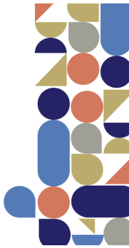
Photo Your Faith contest! The theme is "Finding God in the World." Participants can submit their photos to four categories: nature, sacred spaces, home, and faith in action, for a chance to win a $10,000 grand prize. Pull out your camera and share how you find God in the world in the Photo Your Faith contest — just be sure to submit your photos by Oct. 11, 2021. Go to faithcounts.com for details.